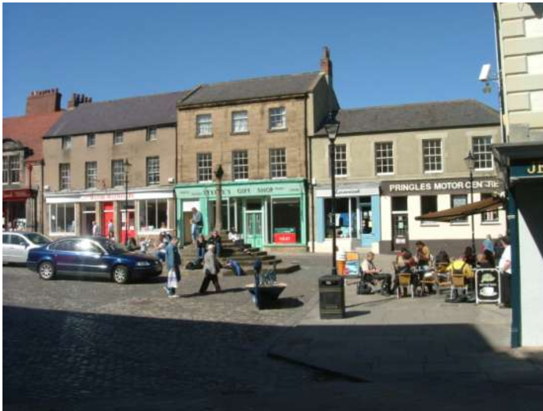
Figure 2: Alnwick Market Place

Millennium Place Durham was created with finance from the Millennium Commission and is an example of contemporary ‘design-led’ pedestrianised public spaces. The square is enclosed by a theatre, cinema and a number of chain bars and restaurants. It is minimalist, leaving one with a feeling of exposure and therefore less likely to provide opportunities for developing a strong place attachment. The street furniture is crafted to a high quality but seating is perhaps more aesthetically pleasing than user-friendly. The minimalist design is in stark contrast to the nearby historic quarter of Durham and connections to the town centre are problematic.